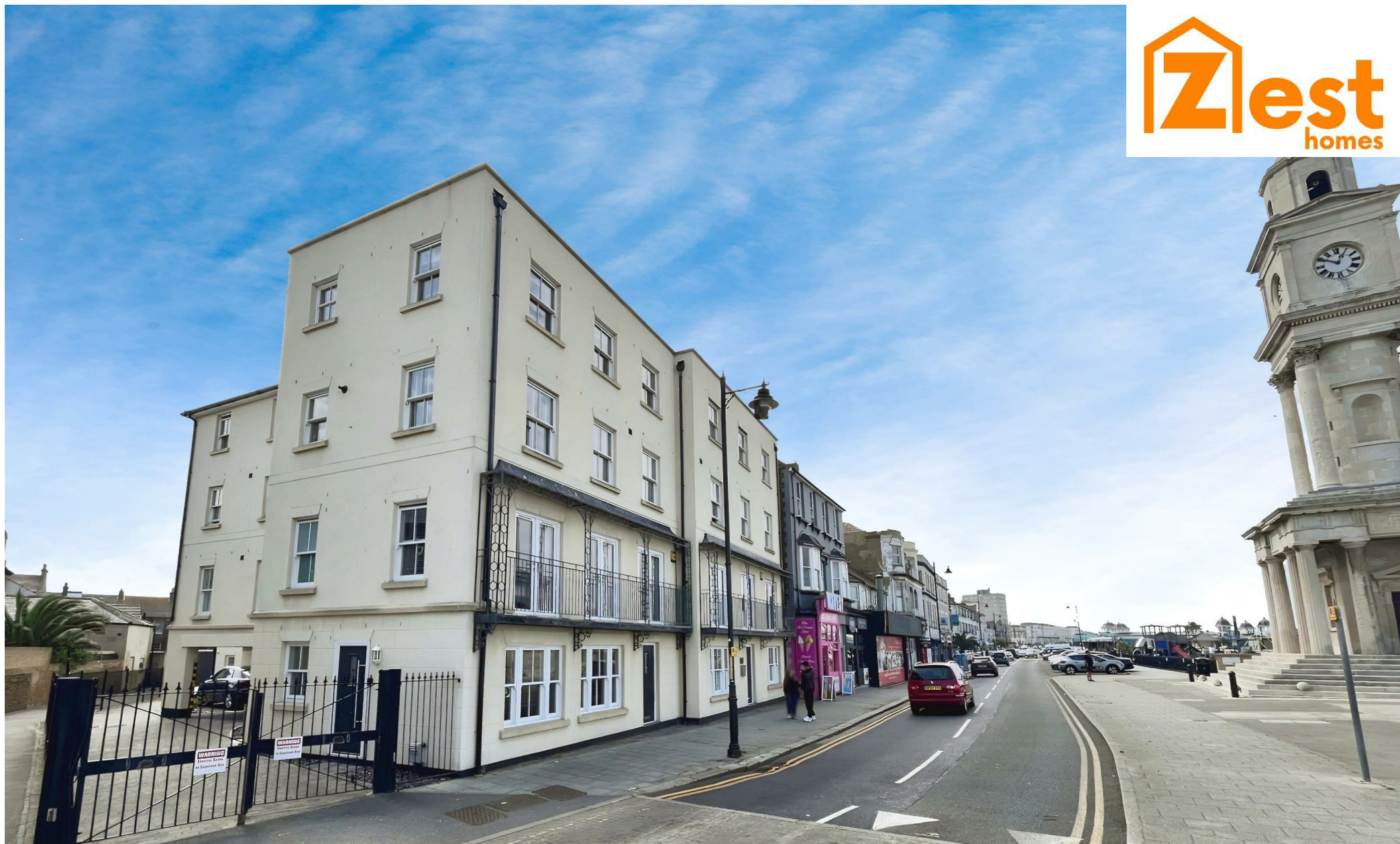
Flat 11, Bayview Central Parade, Herne Bay, CT6 5JQ £1,250 Per month